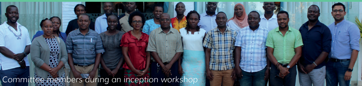
Committee members during an inception workshop

Committee Goal: To be the leader in all-inclusive and sustainable sanitation for growth